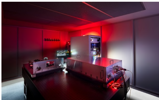
Fig. 1 The quantum frequency converter developed by Fraunhofer ILT allows qubits to be transmitted with low noise and loss between distributed quantum computers via existing telecommunications networks.

Lecture program at the World of Quantum: Application panels: Topic overview (world-of-photonics.com)